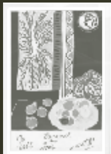
MATISSE Nice color lithograph