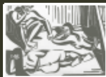
WOLF Tahiti woodcut