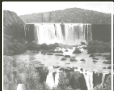
BART PERRY Waterfall oils on canvas